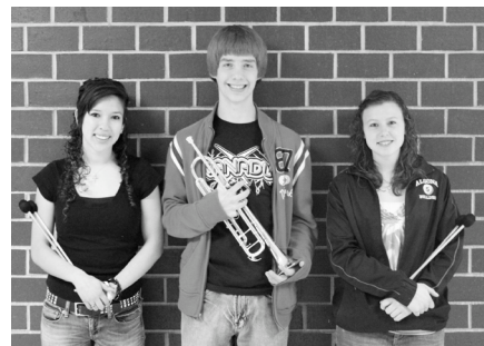
Below: Instrumental Music Division I Recipients